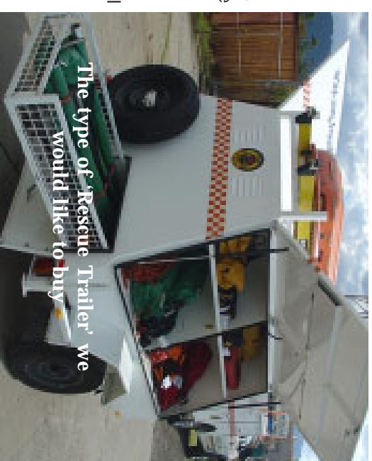
The type of 'Rescue Trailer' we would like to buy

We also are trying to get the money for a 'rescue trailer' for more disastrous events in our region. The New England Mutual has already given us $1000 towards this ambitious project, but we need more, up to $1500 to buy equipment and to cover running costs.