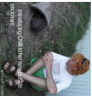
Introducing Chilli to her new outside enclosure.

Chilli is now a happy, healthy 6kg and has been moved to her new outside enclosure – which she LOVES!! She's been doing all the normal wombatly things, like eating lots of grass, exploring the great outdoors and digging (well, renovating!) her very