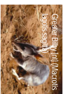
Greater Bilby (Macrotis lagotis)