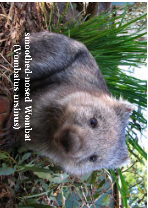
smoothed-nosed Wombat (Vombatus ursinus)

The reason that I have thought that critical care would assist possums in particular is that possums have the same type of gut as our rabbits/guinea