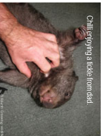
Chilli enjoying a tickle from dad.

Chilli has a long way to go before release. She's 6kg now but she has to be a whopping 18 to 20kg before release. In the mean time, she'll enjoy her half human – half wombat life. Down the track she'll be "de-humanised" but for now she likes her quality time with her human mum and dad!!