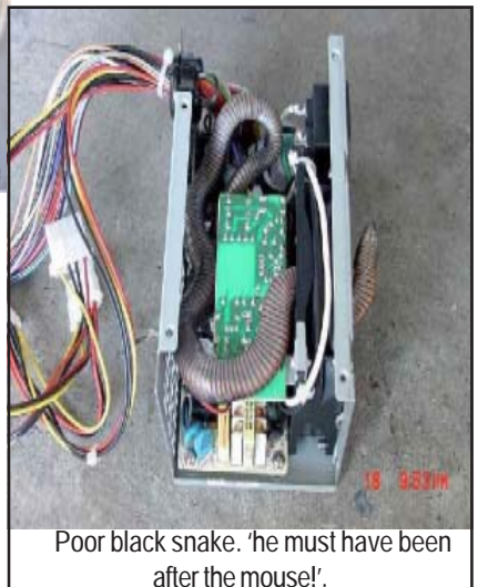
Poor black snake. 'he must have been after the mouse!'

"The coarse-haired wombats are most at home in the forests, and are well distributed throughout the ranges of Southern Australia and Tasmania. They live during the day in large holes, which they excavate into the side of a hill or bank, and come out during the late afternoon or evening to feed. Quiet, inoffensive, and rather wary they are seldom