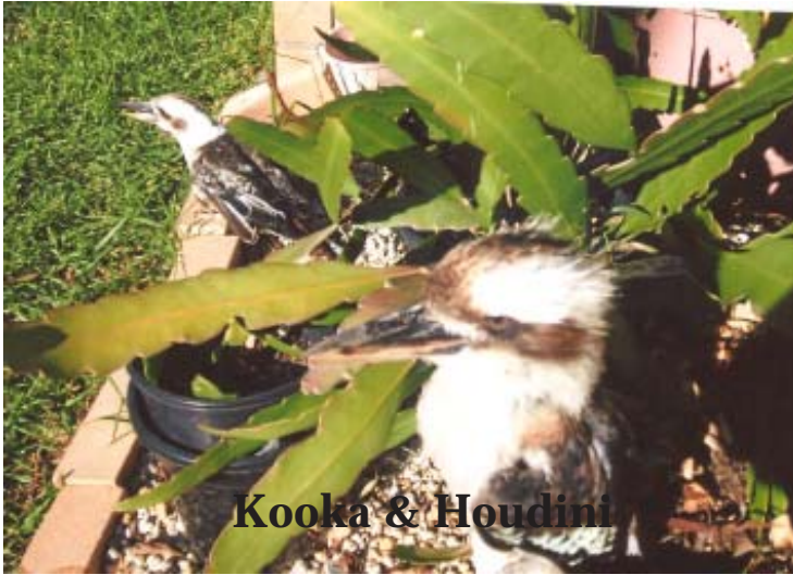
Kooka & Houdini

They both had their own cage into which they went at night time and then out into the yard in the morning, but if the day was not sociable then into the house they would come as being invalids they did not have the