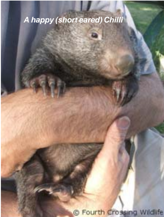
A happy (short eared) Chilli

from "The Wild Animals of Australasia" by Le Souef & Burrell, 1926.