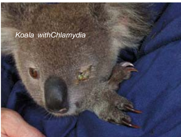
Koala with Chlamydia

It is considered that Chlamydiosis is now more