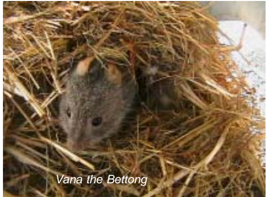
Vana the Bettong

Vana a Bettong arriving in Tenterfield as a healthy orphan. The fun then began to find a carer who had experience with bettongs, there was the feeding and their